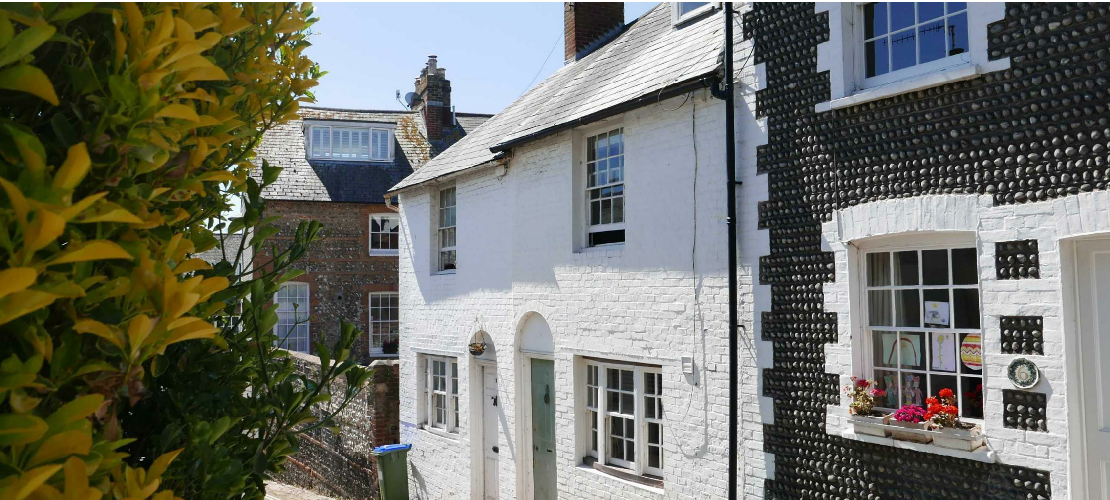
St Nicholas Lane, Lewes